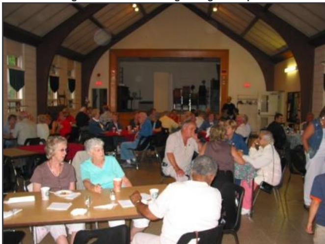
A good time was had by all.